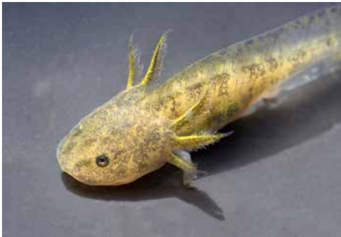
California tiger salamander larva and detail of the legs that start developing as the metamorphosis progresses (Robin Agarwal)