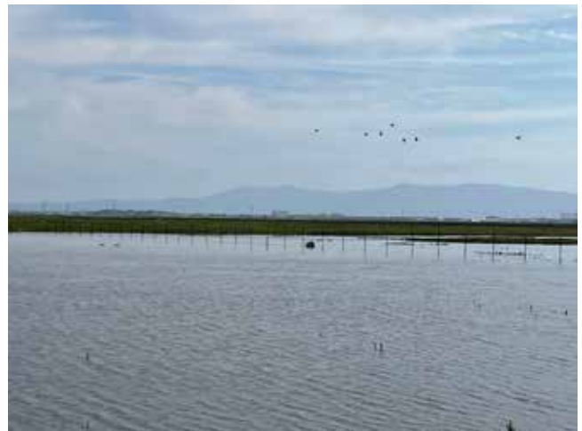
Pools filled in their highest capacity because of the frequent strong storm events in 2023

Year 2023 storms resulted in fully inundated pools literally brimming with life. The confluence of long pool hydroperiods and the high frequency of precipitation events greatly benefits aquatic species that breed in the pools, and those that require extended periods of inundation to succeed in breeding. For example, here at Warm Springs Unit, this year, the federally endangered vernal pool tadpole shrimp, which needs 6 weeks to complete its cycle, and the federally threatened California tiger salamander, which needs a minimum of three months for full metamorphosis of the larvae to occur, have an exceptionally good year in pools since lengthy hydroperiods allow them to comfortably complete their cycle. Our monitoring program is still in full swing. Dozens of volunteer biologists and naturalists have joined Refuge staff to offer help surveying this years’ oversized pools. Despite the difficult weather conditions and the long hours of dip-netting, there was a celebratory atmosphere among the surveyors for a good reason. We are super excited to report that our two listed species have been present in a record high number of pools! This is a boom year!