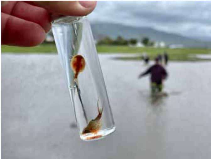
The monitoring program at Warm Springs Unit helps assess the health of the vernal pool ecosystem and adapt management accordingly (Robin Agarwal)