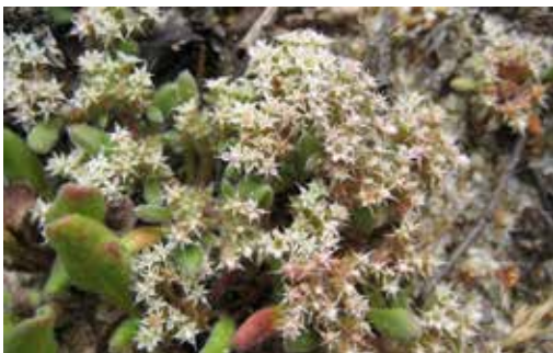
Monterey Spineflower

Affirming moments like these occur throughout the seasons as refuge personnel, together with partners, work to protect and recover Federally Listed species found throughout the Monterey Bay Area. For some species, like the Federally Threatened Western Snowy Plover, the full range extends along the entire Pacific Coast. For others, including the Federally Threatened Monterey Spineflower, the range occurs just in pockets along the central coast of California. But for species, such as the Santa Cruz Long-toed Salamander with its range limited to southern Santa Cruz and northern Monterey Counties, the Monterey Bay Area is their only home.