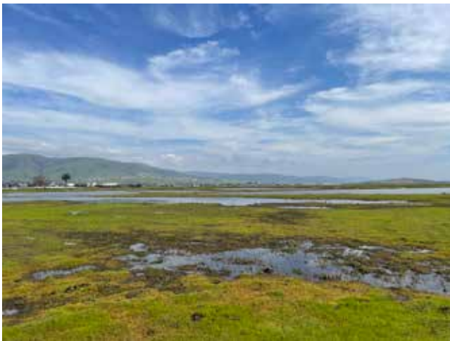
Vernal Pool Grassland at Warm Springs Unit

short to complete the cycle successfully. This meant the adult salamanders exposed themselves to an increased risk of predation and expended a lot of energy without receiving any reproductive benefit. The duration of the ponding was so short, that even vernal pool tadpole shrimp were unable to complete their lifecycle. If this drought/erratic precipitation were to continue, we worried that their viable cysts, which are fertilized embryos encapsulated in a capsule structure, would be depleted. But when the 2023 storms arrived and kept coming, it was time to rejoice!