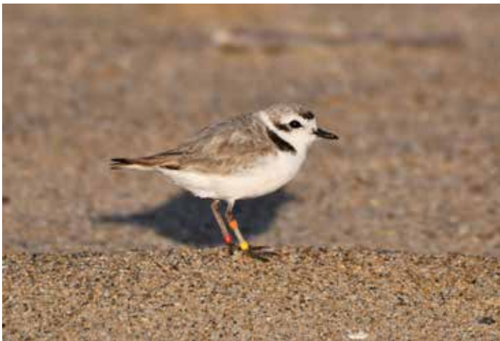
Male Western Snowy Plover (Matthew Slater)

Invasive vegetation management at Salinas will gain a valuable new tool, with comprehensive mapping of invasive species, native habitats and Federally Listed plant species currently being planned for 2024. The resulting maps will also provide data on open sand coverage in the foredunes, a critical component of snowy plover nesting habitat. Refuge personnel and partners, including Point Blue Conservation Science and California State Beaches, have returned to the beaches throughout the Monterey Bay, to monitor plover nest success, an annual collaboration that has continued for close to 30 years. This weekly monitoring is key to mobilizing a rapid response to threats such as raven predation and informs ongoing efforts to improve management strategy success.