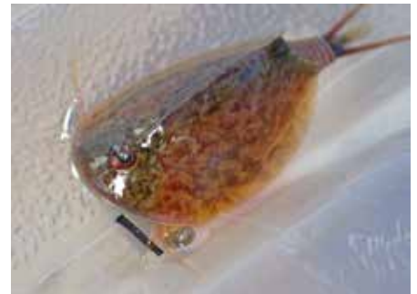
Vernal pool tadpole shrimp (Robin Agarwal)