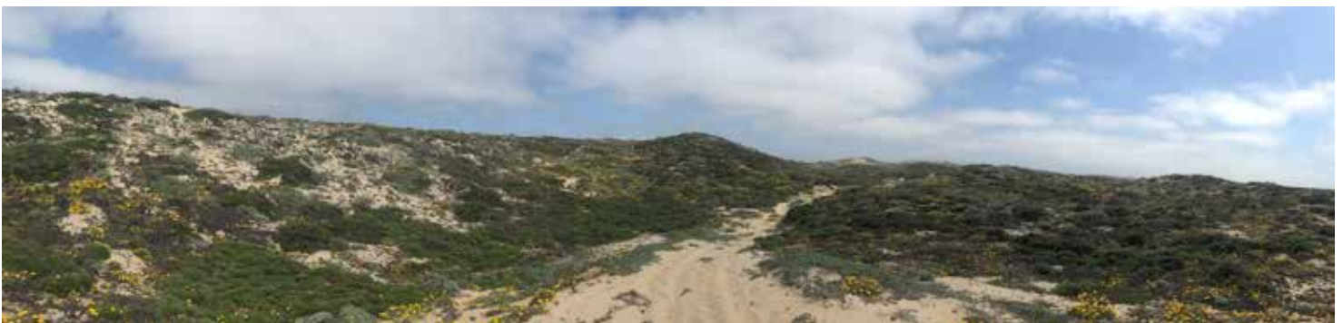
Salinas River NWR Backdunes

Spring at Salinas River NWR. Upon our approach, a flock of roosting gulls raucously protests the intrusion with strident calls. We continue to make our way along the tide line, stopping at intervals to scan the kelp strewn beach and the barren foredunes. The flash of a pale blur darting about, alerts us to the presence of a snowy plover. Following the bird with binoculars and scopes, we note the bold, black markings of a male and color bands, used to identify individual plovers, on both legs. The plover pauses in his dash to snap at kelp flies, giving us an opportunity to read the bands. Ah, this is yellow, red/orange, yellow, an old pro at nesting on the refuge. Meal eaten, he swiftly returns to the foredunes, pausing again to assess the surroundings for any threats, before carefully settling into a small, shallow depression, scraped in the sand. Our patience is rewarded with a brief glimpse of a speckled egg, tucked safely beneath his feathers. The breeding season has begun, and with its arrival, we reaffirm our commitment towards the recovery of a Federally Listed species.