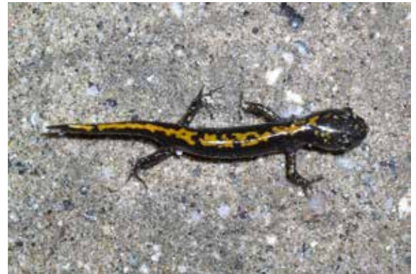
Juvenile Santa Cruz Long-toed Salamander (Heather Butler)

During examination, the slim, black salamander with an orange pattern on back and tail is identified as a Federally Endangered Santa Cruz Long-toed Salamander. The second is larger, more robust in build, with a scattering of pale, yellow spots on a black background, marking it as a Federally Threatened California Tiger Salamander. Measurements indicate that both are juveniles, newly emerged from the pond this year. Processing complete, we release the young salamanders to continue their first migration, into the surrounding Coast Live Oak uplands. We are elated to have confirmation that successful population recruitment occurred at Ellicott Pond.