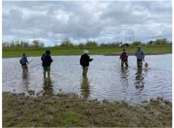
Volunteers joined Refuge staff to conduct the vernal pool aquatic surveys in 2013