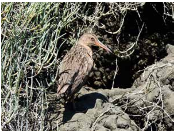
LEFT: Ridgway's Rail (AKA Clapper Rail)

From goldfields to golden anniversaries, let's celebrate Bay Area environmental accomplishments and 50 years of some of our nation's most important environmental laws together this April and throughout the year. We invite you to the San Francisco Bay National Wildlife Refuge Complex Headquarters in Fremont on April 22 to celebrate Earth Day and the 50th Anniversary of the Endangered Species Act. We will have guided walks and wildlife programs, games and arts and crafts, and more. This is free to all, and all are welcome. We hope to see you in Fremont on April 22, but if you can't get there keep an eye out on Eventbrite for other upcoming Complex activities or consider going for hike, bird watching, or whatever your favorite outdoor activity and celebrate these milestones in your own special way.