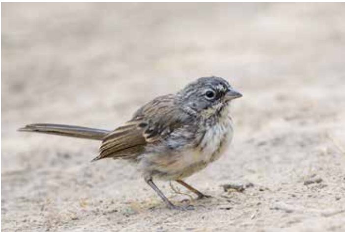
Bell's Sparrow

Since colonization, the island has been mainly used for grain and livestock farming. The grazing of livestock, including goats, pigs, cattle, and sheep, began to degrade the island's habitats. This habitat destruction induced a dramatic decline in local wildlife populations. Some of which included the San Clemente Island paintbrush, lotus, larkspur, and bushmallow plants, along with the San Clemente Bell's sparrow. These species were all federally listed as endangered in 1977. All are endemic to California, meaning they are not found anywhere else in the world. In addition, many of these species are only found on San Clemente Island.