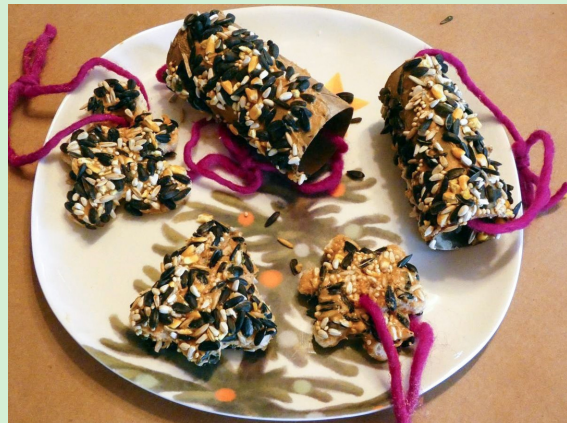
Photo Credits: Student Conservation Association (SCA) Reference: https://www.thesca.org/connect/blog/giving-back-birds