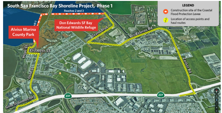
Areas of Construction and Haul Routes

Trucks entering the construction site from the Alviso Marina County Park will use State Route 237 to Lafayette Street/ Great America Parkway to the Gold Street connector to Gold Street to Elizabeth Street. They will take Elizabeth Street to Hope Street and then use the eastern most county park maintenance access road. Trucks that enter the construction site from the USFWS Refuge Visitor Center will use State Route 237 to Zanker Road/Los Esteros Road to Grand Boulevard. Trucks will generally exit the same way they came in.