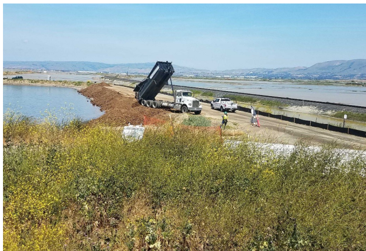
Soil was delivered to Pond A12 for use on future levee construction.