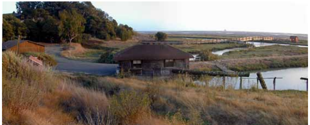
Pump house that had been renovated into an environmental education classroom.

In its first decade of existence, the Society wanted to help other National Wildlife Refuges in the western region. Bookstores on those refuges were established to better support their specific projects. The board members wanted to offer their assistance, just as Coastal Parks Association at Point Reyes National Seashore had done