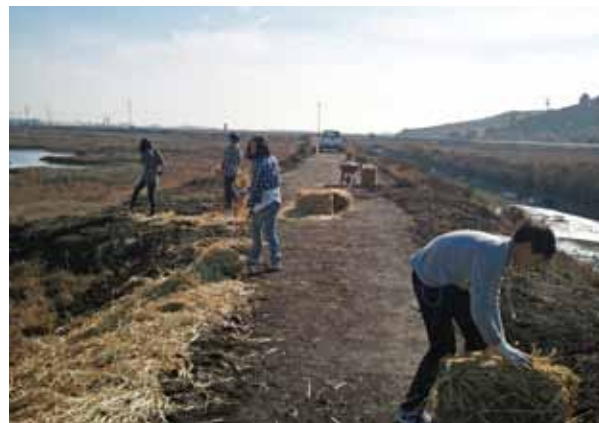
Left: Habitat Heroes distributing rice straw over the seeded areas. Right: Aerial photo of LaRiviere Marsh in 2008.

However, the upland edges of the marsh were not so successful. Invasive plants dominate these edges, degrading the habitat